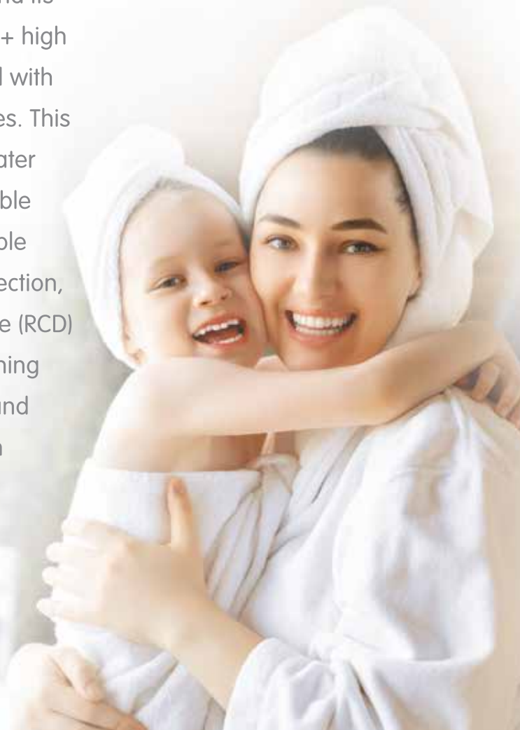
Ag+ Silver Ion Technology

Experience luxurious showers with the 707 Luxton and its powerful HydroJet Ag+ high pressure showerhead with antibacterial properties. This remarkable water heater is equipped with reliable safety features – double safety anti-scald protection, residual current device (RCD) and an overheat warning indicator. Enjoy safe and relaxing showers with 707 Luxton.